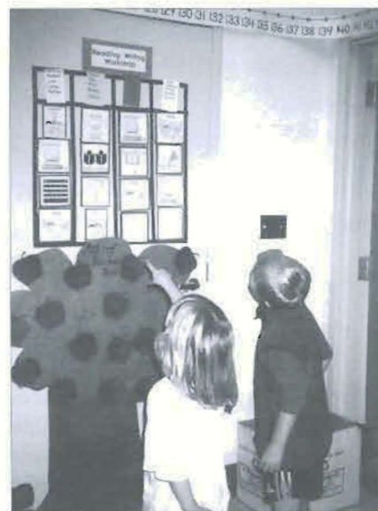
Reading and Writing Workshop