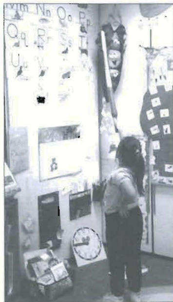
Reading Around the Room

The listening center contains books and tapes. This center can either be stationary or individual tape players with headphones can be provided allowing students to listen to a story anywhere in the classroom. Response sheets or journals are available for the students as a form of documentation.