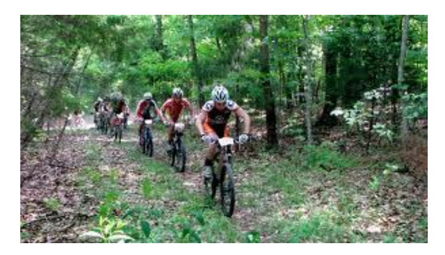
Racers at Bays Mountain.

For riders who want to step up to the challenge of riding competitively, stopping at a local bike shop and asking the employees about the mountain bike racing scene in the area might be the first step to a shelf full of trophies and a lifetime of fun and memories.