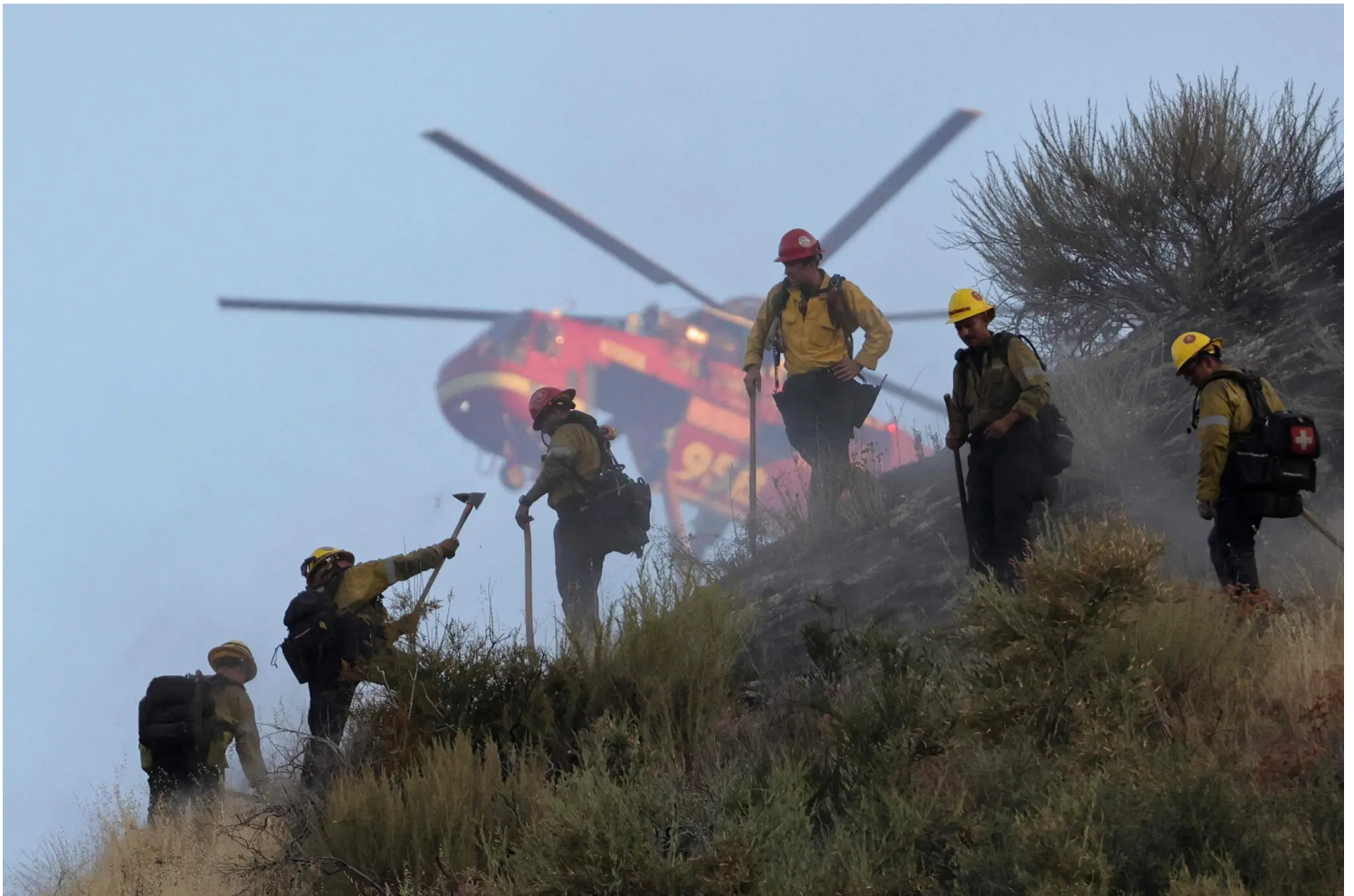
Firefighters battling the Agua Fire in Soledad Canyon near Agua Dulce, Calif., last month.