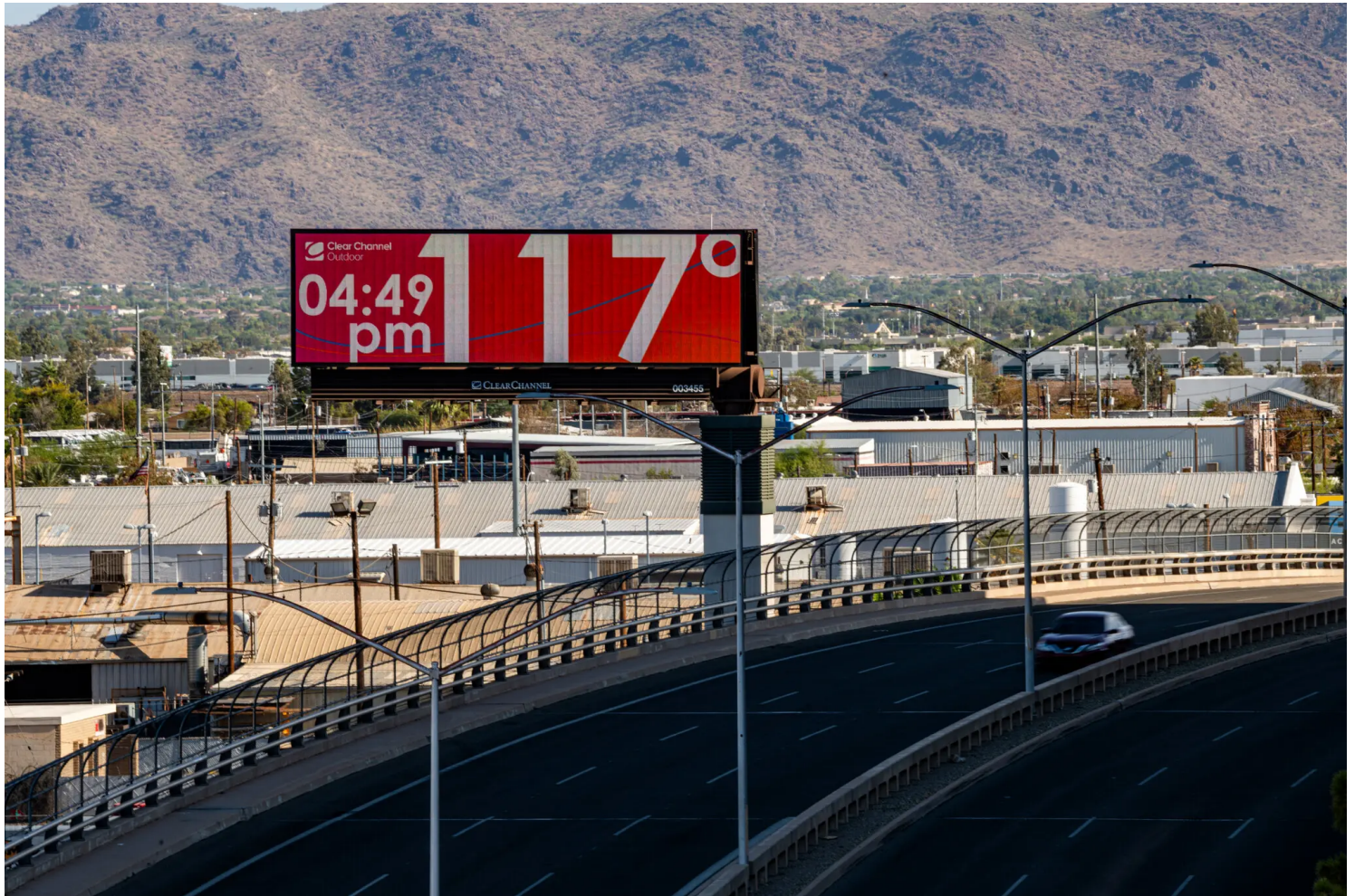
In July, Phoenix experienced a record-breaking streak of above-100-degree days.

The plan calls for shuttering a Department of Energy office that has $400 billion in loan authority to help emerging green technologies. It would make it more difficult for solar, wind and other renewable power — the fastest growing energy source in the United States — to be added to the grid. Climate change would no longer be considered an issue worthy of discussion on the National Security Council, and allied nations would be encouraged to buy and use more fossil fuels rather than renewable energy.