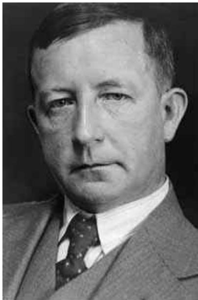
Thoralf A. Skolem (May 23, 1887–March 23, 1963)

reference the 1958 paper of triple systems.