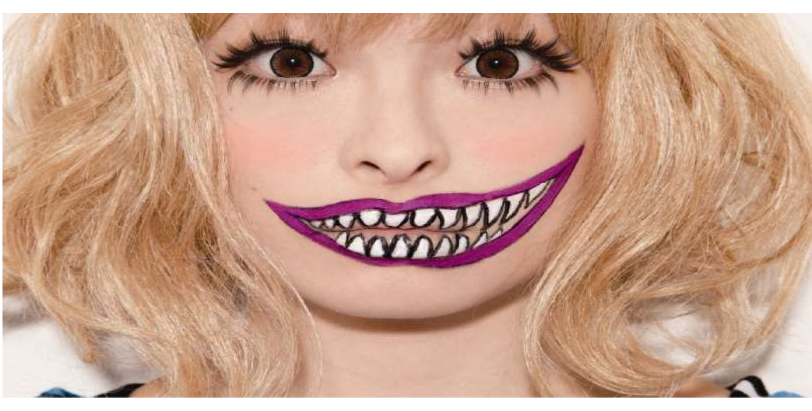
Kyary Pamyu Pamyu: More than a